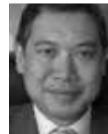
Dow-Mu Koh London/UK